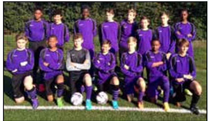
Year 9 Football