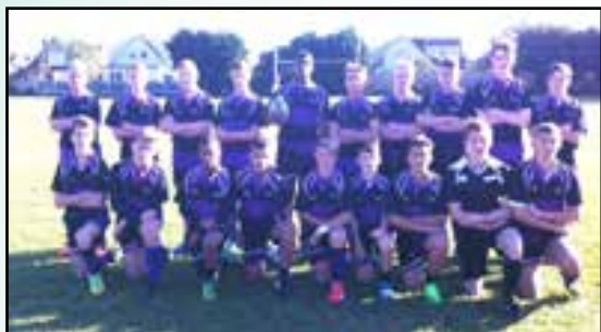
Year 10 Rugby

St Cleres: 34 – 10 (Won) Robert Clack: 50 – 5 (Lost)