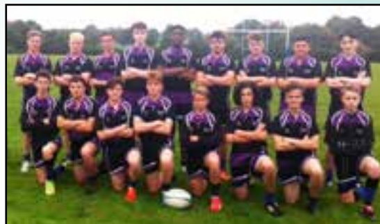
Senior Rugby Team

The following pupils played in the team: