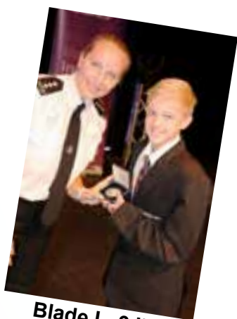
Blade L, 9JLt