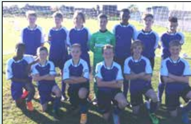
Year 8 Football

Like the Year 8 football team the Year 9s have also experienced a mixed start to the season winning 2 and losing two games, with the most notable game coming in the 1st round of the Essex Cup, where Woodlands progressed to the next round courtesy of a penalty shoot-out win against Eastwood.